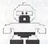
MUSCLE MAN Muscle Driver